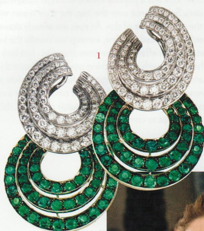
1. Galaxie earrings in white gold with 106 emeralds and 154 diamonds from ADLER , info@adler.ch 2. Jessica Biel wearing Les Ardentes jewellery from LOUIS VUITTON at the 2009 Oscars

Step onto any red carpet this year and you'll be swamped by the parade of strapless dresses. They are popular for a number of reasons – they give ample cleavage, show off glowing shoulders and arms, and best of all, give the illusion of a longer neck. With so much bare skin, no wonder the necklace has taken centre stage. Chunky dramatic styles, sautoirs and colourful chokers were spotted adorning the necklines of Devon Aoki and Diane Lane. For those who dared to bare, earrings, bracelets and rings were the fashionable accompaniment.