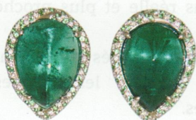
Green Delight Earrings in white gold, with central drop-cut cabochon emerald (34.64 cts) surrounded by diamonds (1.07 cts) and tsavorites (1.61 cts)