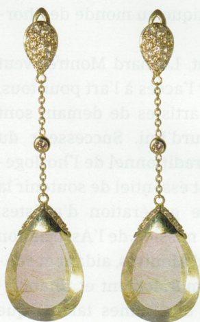
Ice and sun Sun: Earrings in yellow gold with rutile quartz (21.85 cts) set in yellow gold, white diamonds (0.45 cts) and brown diamonds (0.61 cts)