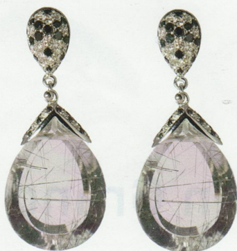
Ice and sun Ice: Earrings with rutile white quartz (22.18 cts), set in white gold with black diamonds (0.46 cts) and white diamonds (0.52 cts)

Texte © Susanna Gorga