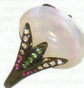
Lotus Rng in black gold, mother of pearl quartz cabochon (21.53 cts), set with pink sapphires (0.19 cts), tsavorites (0.13 cts) and diamonds (0.03 cts)