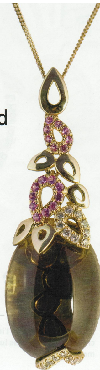
Feuille Pendant in pink gold, smoky quartz cabochon (26.52 cts) set with pink sapphires (0.39 cts) and diamonds (0.23 cts)