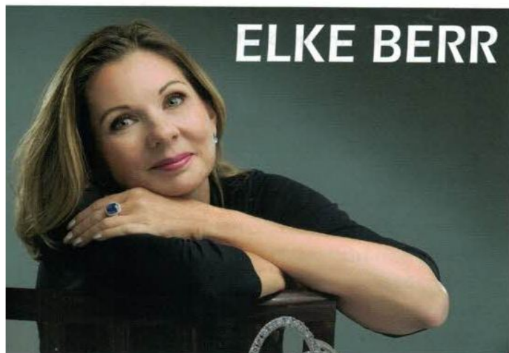
18K gold ring with a 10.24-ct Paraiba tourmaline and diamonds.