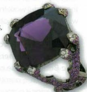
"Purple's Charm" ring with an 11.62-ct natural Burmese purple spinel, amethysts, pink sapphires, diamonds and 18K black gold.