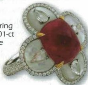
"Love's Potion" ring made with a 9.01-ct natural Burmese ruby, diamonds and 18K gold.