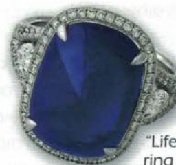
"Life's Elixir" ring with an 11.81-ct natural Burmese Royal Blue sapphire, diamonds and 18K gold.