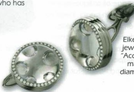
Elke also designs men's jewelry as seen in these "Acqua Bubble" cufflinks made of rock crystal, diamonds, and 18K gold.