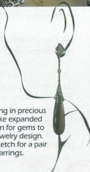
From trading in precious stones, Elke expanded her passion for gems to include jewelry design. Here is a sketch for a pair of earrings.