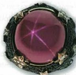
Ring with a 33.9-ct unheated Burmese star ruby and black and white diamonds set in 18K gold.